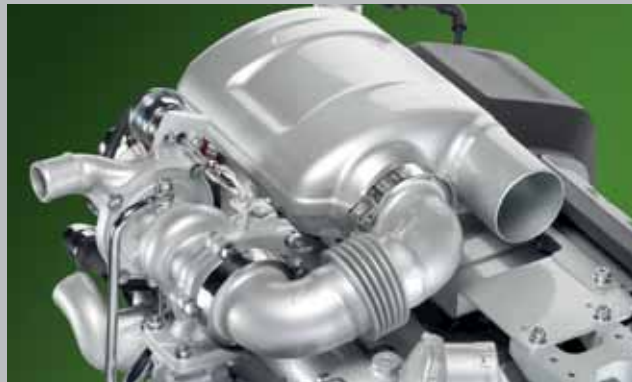
Exclusive DOC system meets all emissions standards in one compact system without AdBlue.