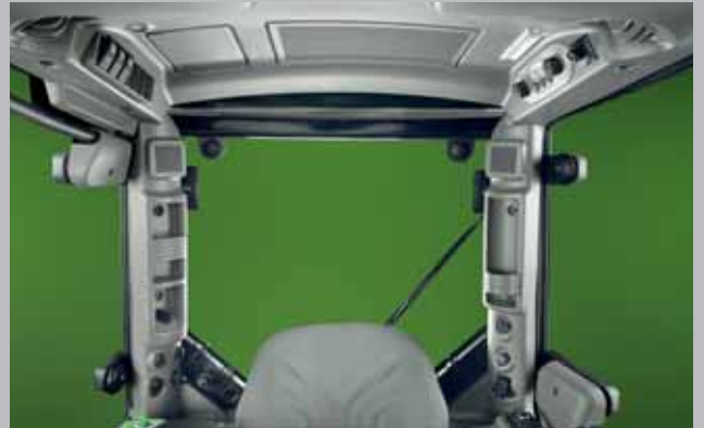
The air conditioning controls are easy to access on a display in the roof of the cab.