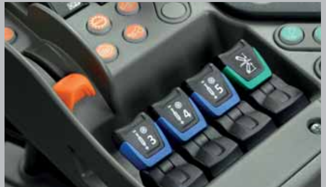
The activation of the front axle suspension is easy to access in the MaxCom control panel.