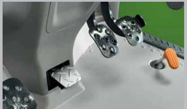
The level cab floor provides more space, more legroom and an optimum pedal and seating position.

engine speed are shown on analogue dials. The driver receives all information in real time and can program operating sequences. The operating elements for activating the automatic functions, such as front axle suspension, Auto4WD and SDD fast steering as well as the lever for the hydraulic parking brake (HPB) and a mobile phone holder are located to the left and right of the InfoCenterPro. A driver's seat with air springs and a multimedia radio are available as additional options. This provides the driver with everything they need for completing their tasks comfortably and efficiently.