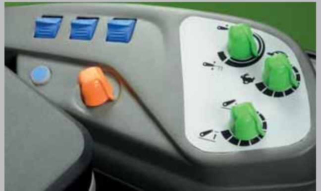
Clearly colour-coded fingertip and rotary buttons for intuitive handling and operation.