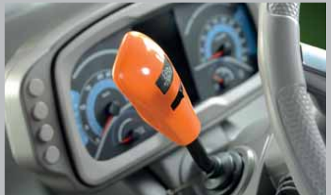
The direction of driving can be reversed with the individually adjustable powershuttle lever to the left of the steering wheel.