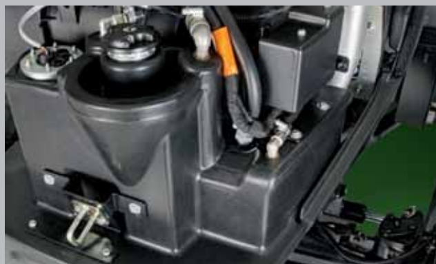
The fuel tank integrated into the front axle support can be filled even with the bonnet closed, while the auxiliary tank is located underneath the chassis.

standards (emissions level III B). Top performance for specialist tractors – the FARMotion already delivers its top power (115 or 113 HP) at 2,200 rpm. All engine components, such as radiator, fan, hoses