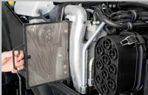
The large redesigned cooling package, the improved air guiding and the PowerCore air filter support engine efficiency.

Torque and power are adapted to the toughest tasks. In addition, the new engines are extremely efficient when it comes to diesel consumption. The optimised design allows a narrow bonnet and therefore an excellent view to the front as well as maximum agility. Thanks to state-of-the-art technology of the engines, they comply with all international emissions