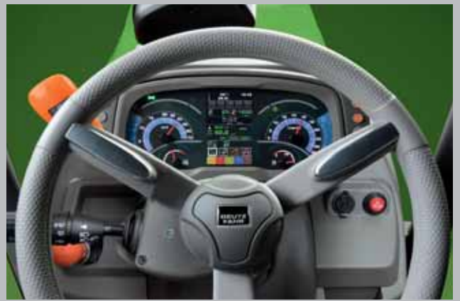
The dashboard provides the driver with digital and analogue information about the operating status of the tractor in real time.

A pedal on the steering column allows easy, comfortable height and angle adjustment of the steering wheel. The dashboard is integrated into the steering column and therefore follows the angle of the steering wheel. This allows drivers of any height optimum view of the operating information and operating elements. The InfoCenterPro with a high-resolution 5" monitor provides the driver with clearly structured information on all operating states of the tractor. Driving speed and